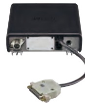
Optional OPC-2078 installation image