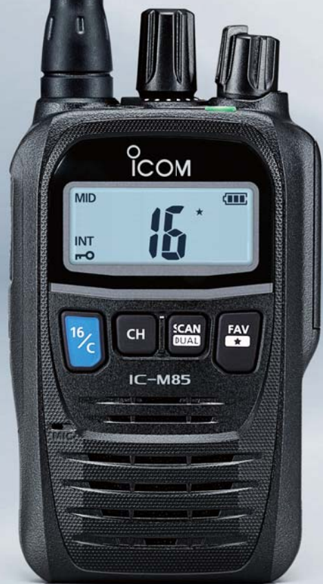
VHF MARINE TRANSCEIVER IC-M85E