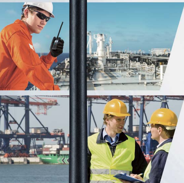
[ Actual Size ]